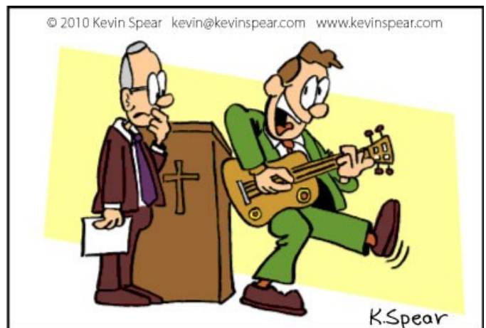
"Everybody now! Sing, 'A Mighty Fortress is Our God!' And bring it on home!"