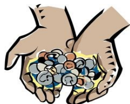
Tithes and offerings

November 6 th ALL SAINTS SUNDAY "What About This?" Luke 20:27-38 November 13 th Holy Communion " A Reminder" Isaiah 12:1-6 November 20 th Christ the King Sunday / Thanksgiving Sunday "Thanks Be to the One" Philippians 4:4-9; Jeremiah 23:5-6 November 27 th 1 st Sunday of Advent "Our Eternal Hope" Matthew 24:36-44; Zephaniah 3:17